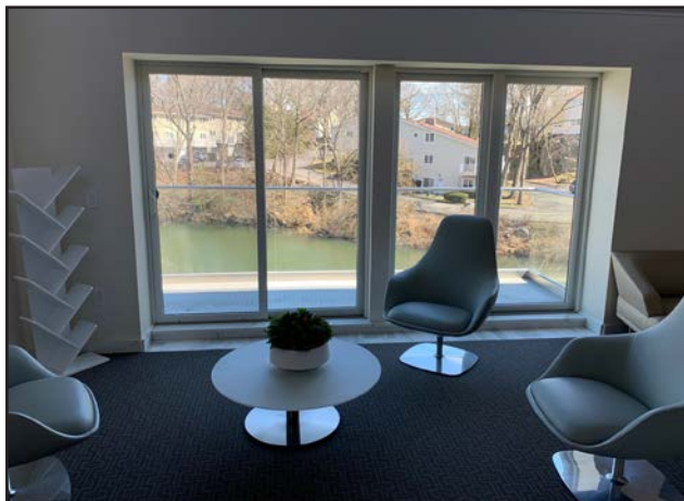
2nd Floor Tenant Meeting Area