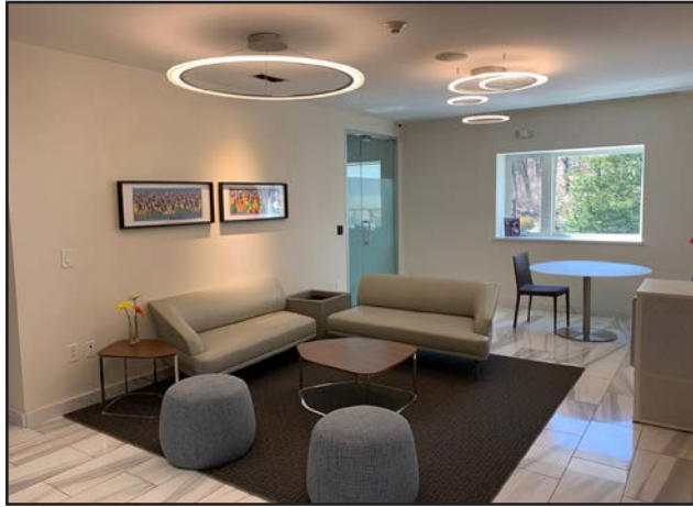
2nd Floor Tenant Reception Area