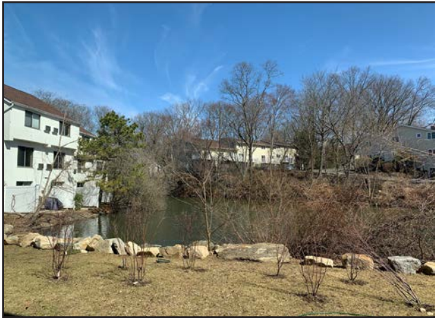
Pond Views from Available Space