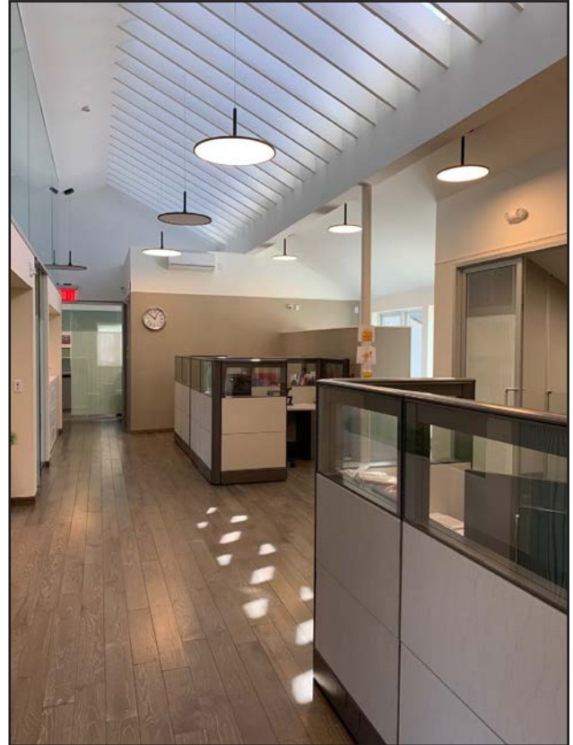
3rd Floor Workstations