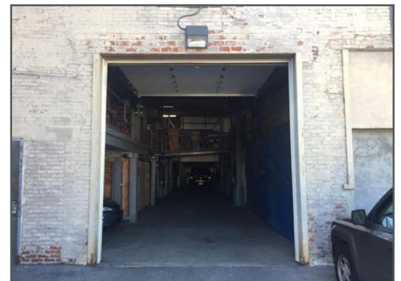
Rear Loading Area