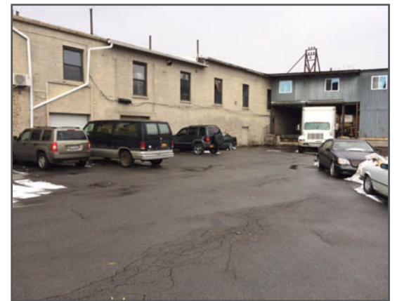
Rear Loading Area