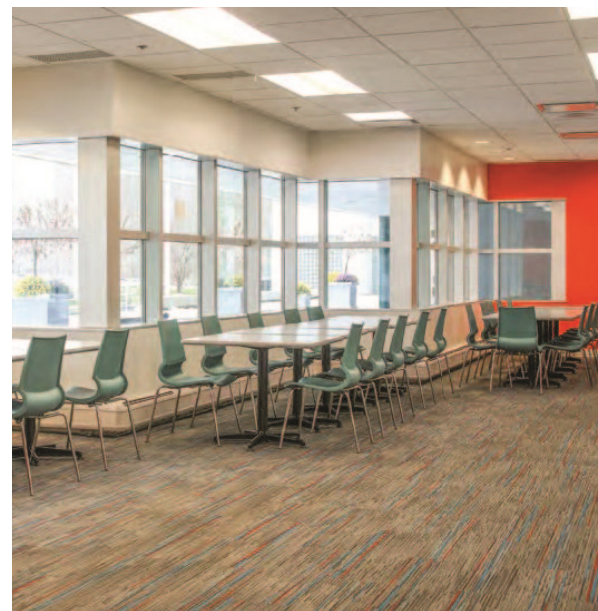
Cafeteria Seating Area