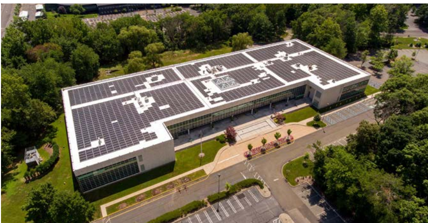
New Solar Rooftop Panels