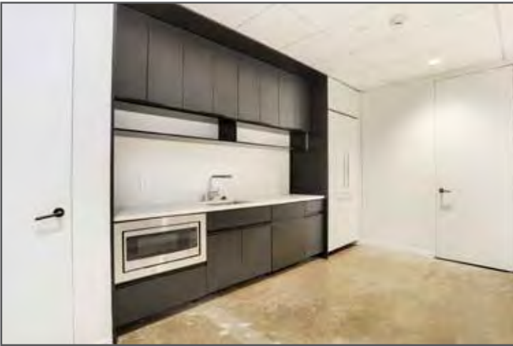
2nd Floor: Kitchen