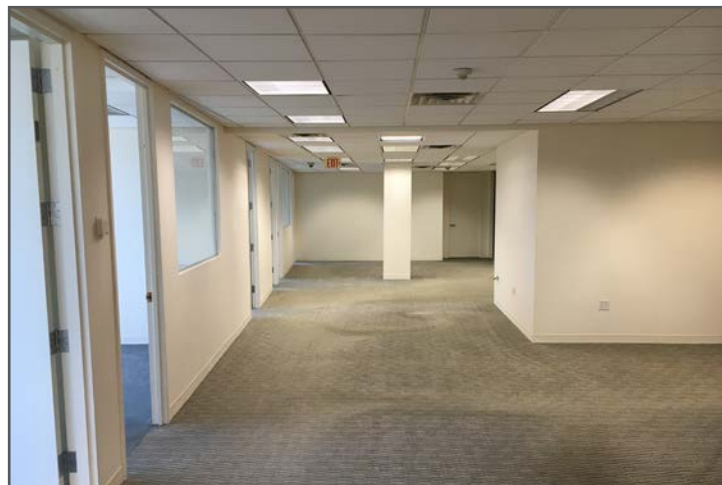
3rd Floor - Click for Virtual Tour