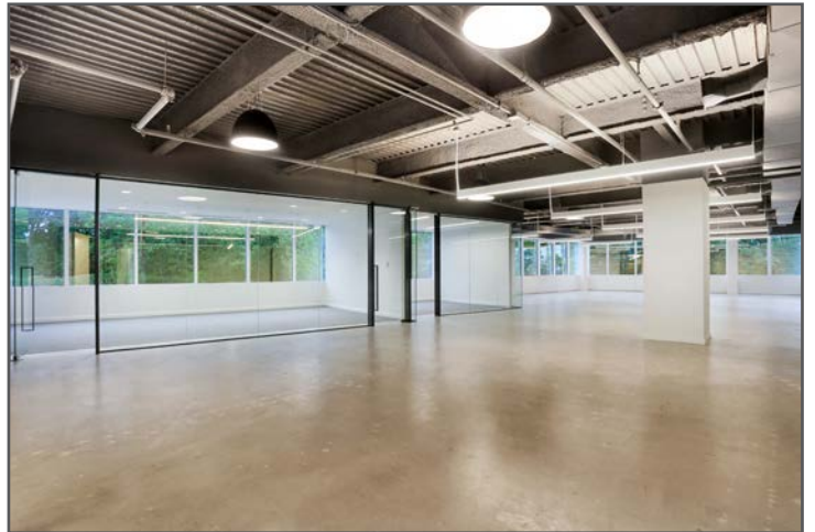
2nd Floor: Pre-Built Office Suites