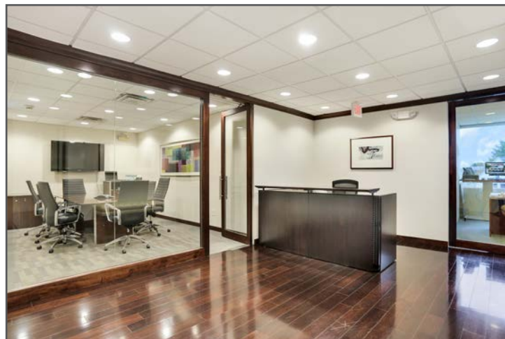
3rd Floor: Reception / Conference