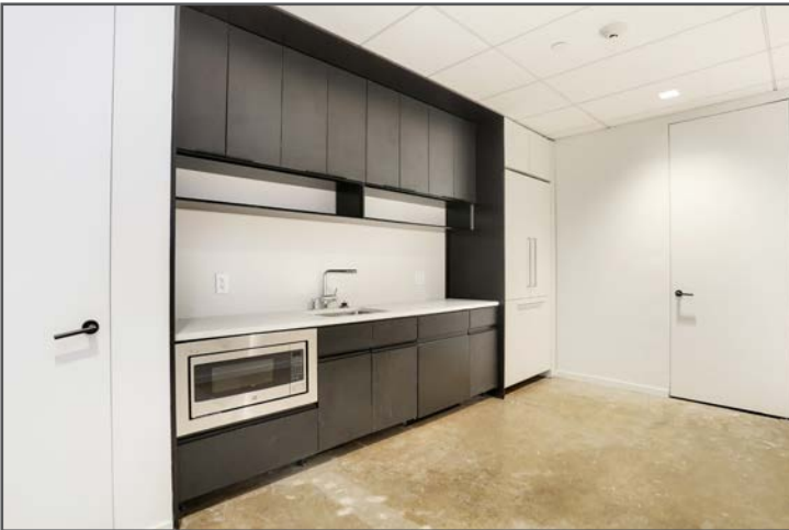
2nd Floor: Kitchen